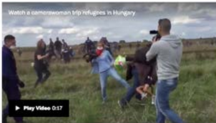
A Hungarian camerawoman with the country's NO TV station is seen tripping a man holding a child. The scene was captured at the Roeszke camp as refugees tried to escape from the police. The woman has since been fired.

By Rick Noack September 8 Follow Rick Noack