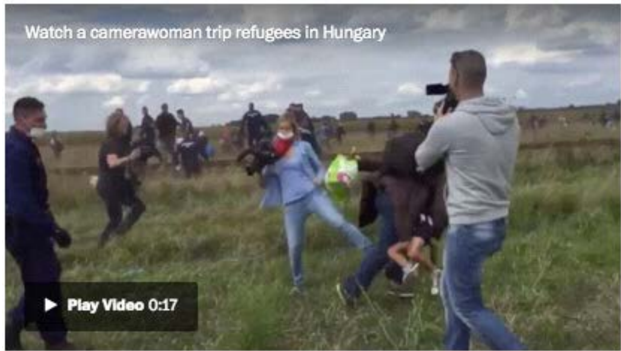
A Hungarian camerawoman with the country's N1 TV station is seen tripping a man holding a child. The scene was captured at the Roeszke camp as refugees tried to escape from the police. The woman has since been fired.